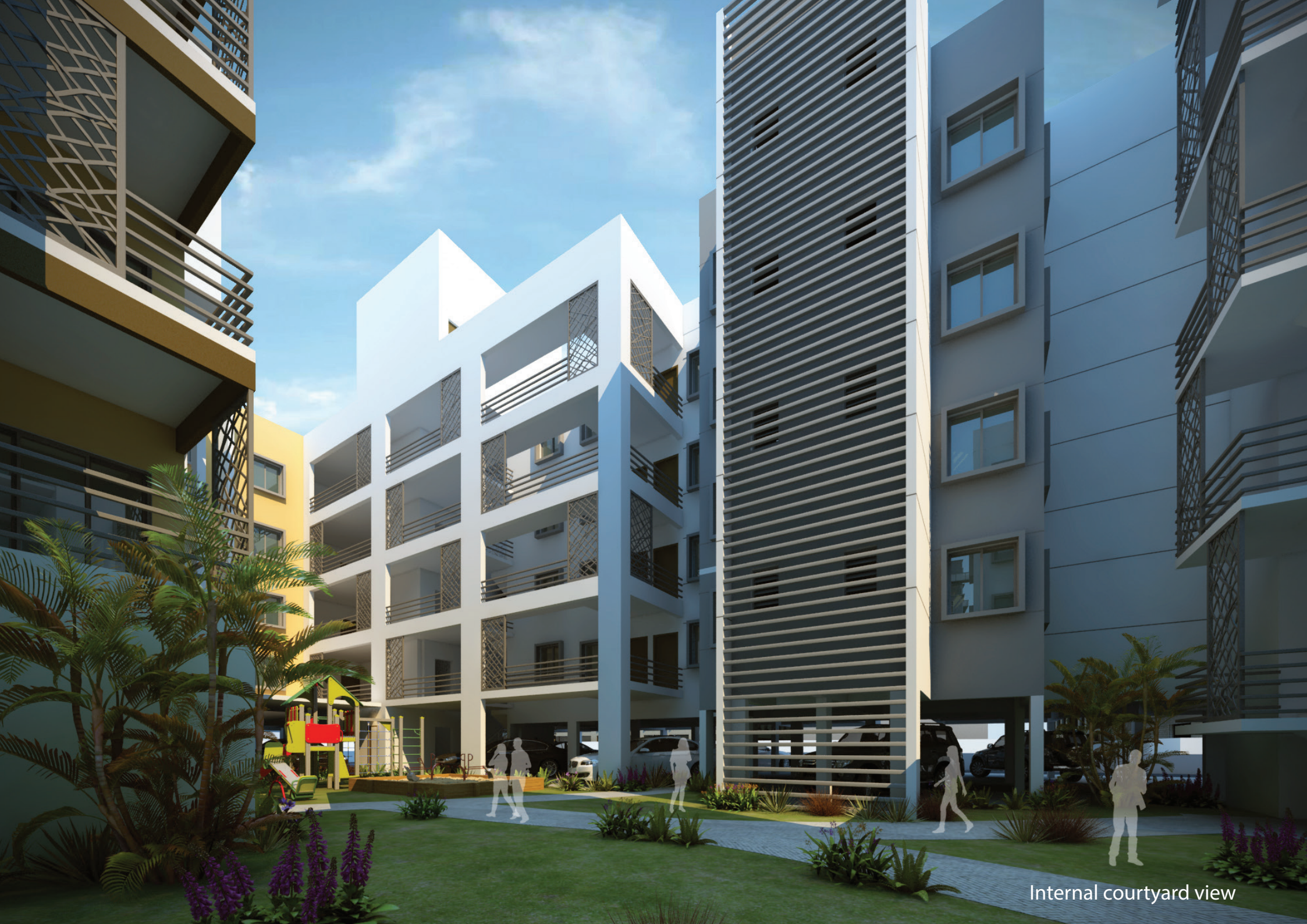
Internal courtyard view